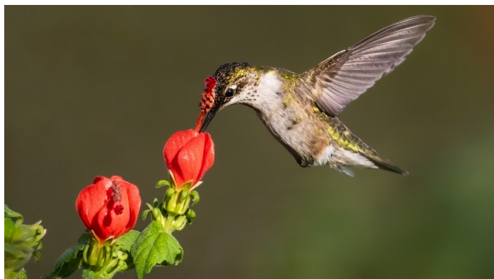
Filling Up For A Long Trip

The images will be judged outside the club. The winner will be announced in December at the Holiday Dinner. The winner will have his/her name engraved on a permanent plaque. The winning image will be printed and then displayed in the Bayland case.