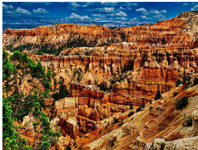
View Into Bryce Canyon

Congratulations to all our GSCCC winners. Great images.