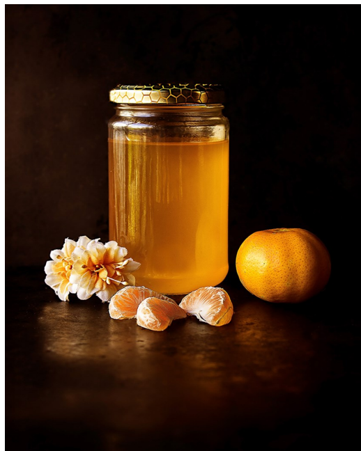
Honey & Fruit

The year-end results will be announced and awards presented at the annual awards banquet, August 19 .