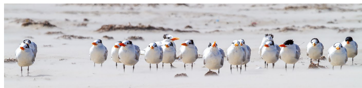
Terns In A Row