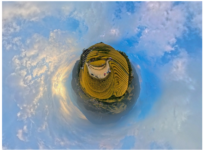
Rice Field In The Cloud Sea PANO