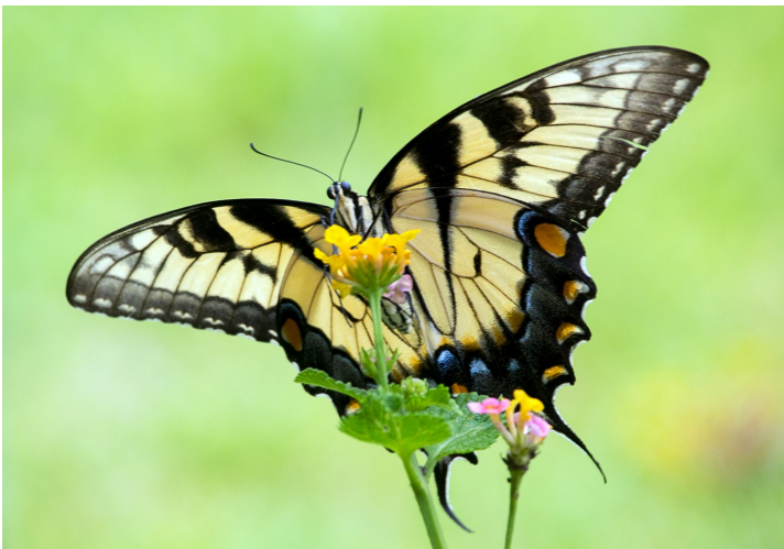
Tiger Swallowtail 2