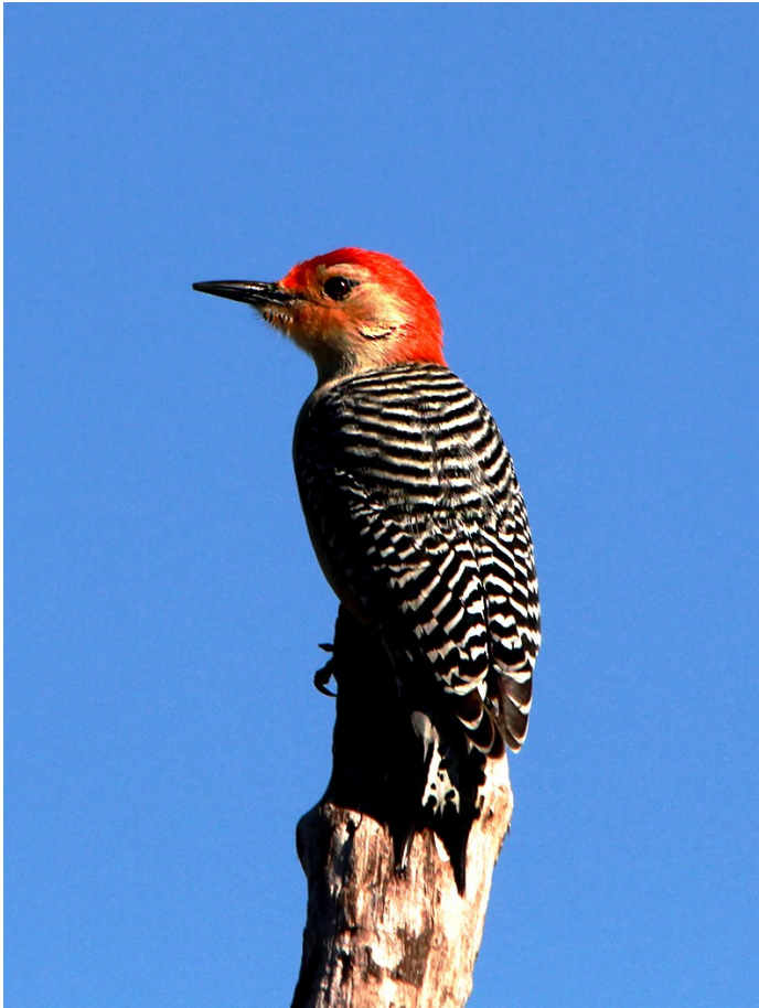
Red-Bellied Wood Pecker On Lookout

Houston Camera Club judged this competition.