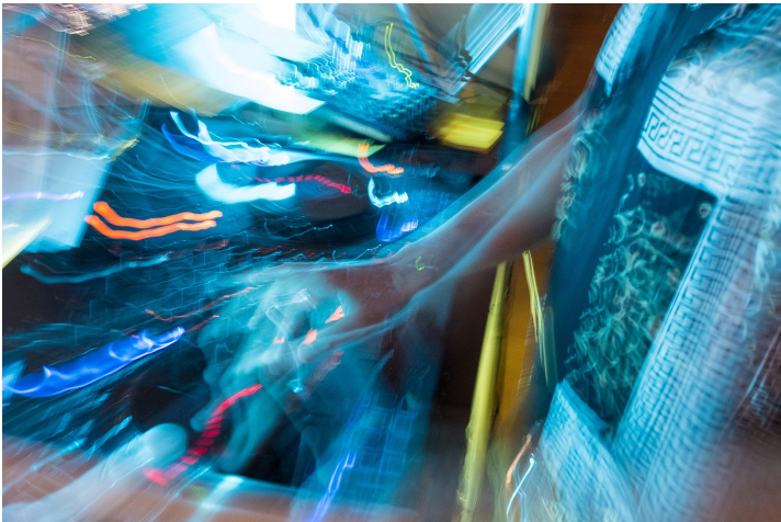
DJ By: Iain Cridland