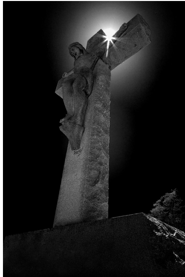
Cross By: Rachel Burychka