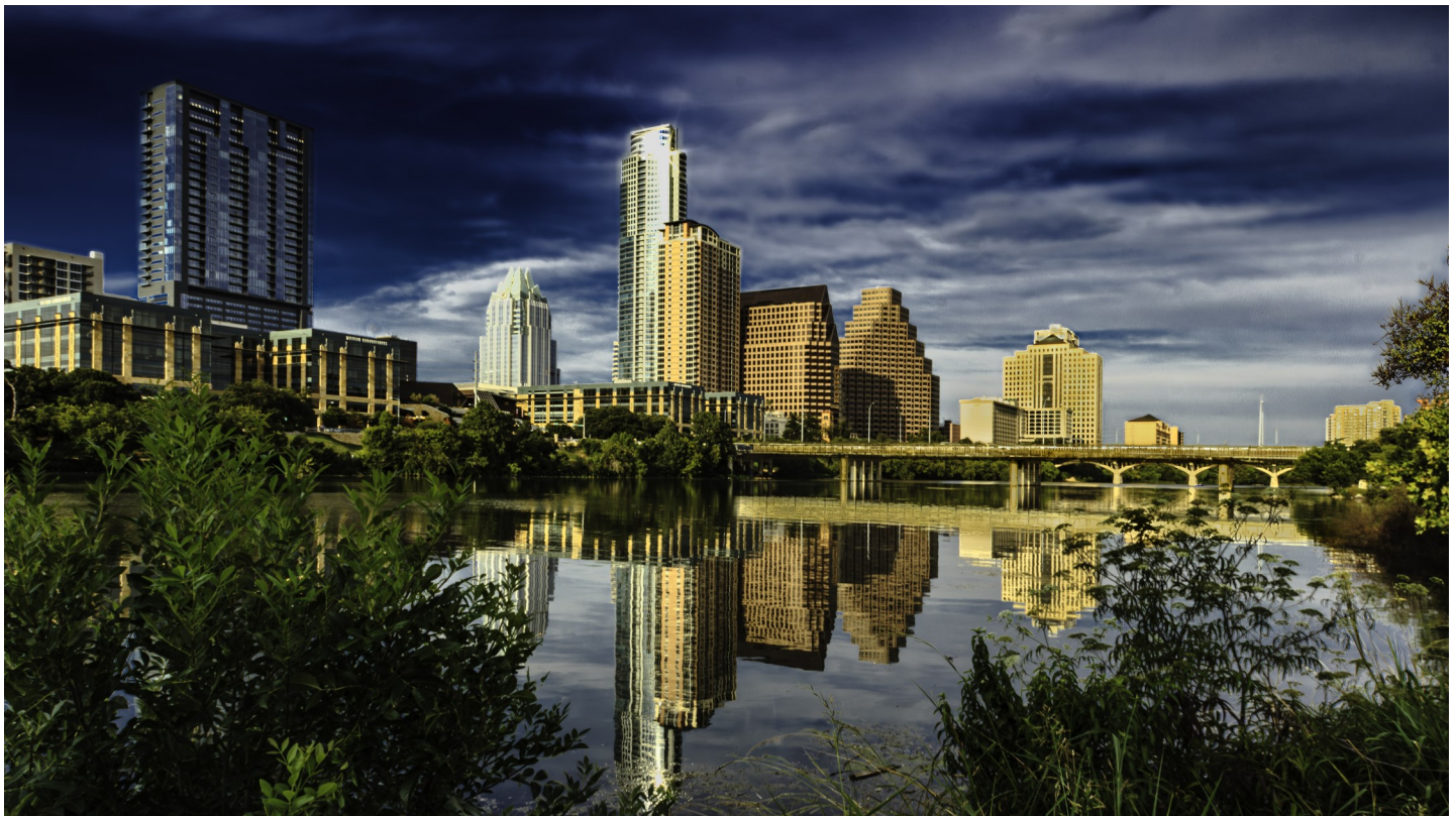
Colorado River Congress Street Bridge, Austin, TX