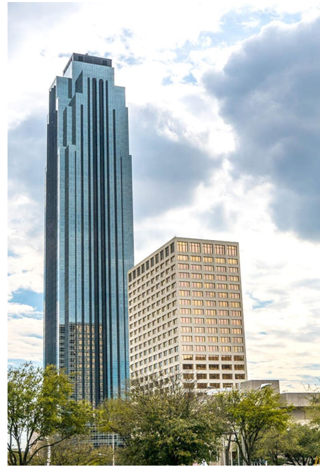
Williams Tower