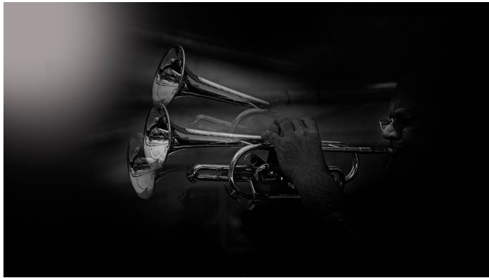
Jazz At Night