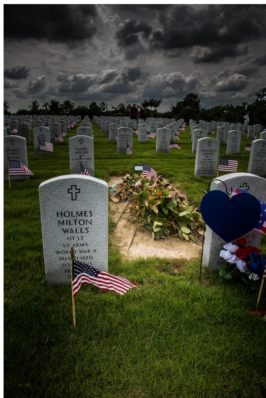
Veteran Arrival

They should be submitted to hccprojection@gmail.com