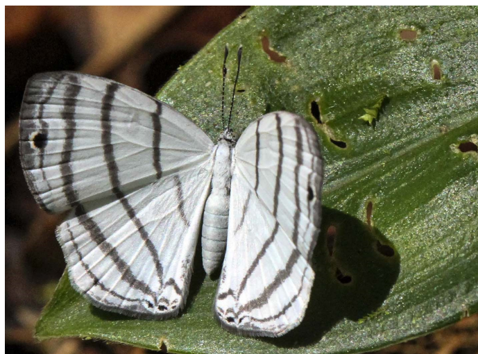
Cloudy Eye Whitemark, Leucochimona lagora

While it wasn't a photo workshop, many pictures were taken during the daily hikes of gardens, national parks, and lush rainforests. Costa Rica's iconic butterfly, the blue morpho, was elusive but there were many other beauties around. The glass wing was a favorite. A plus was a night-time black light set-up to watch and photograph many varieties of beautiful moths.