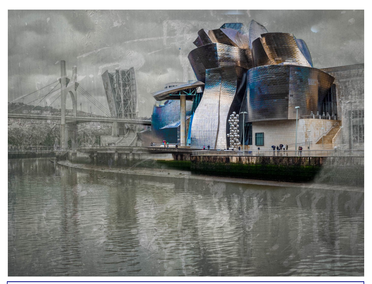
Guggenheim Museum, Bilbao