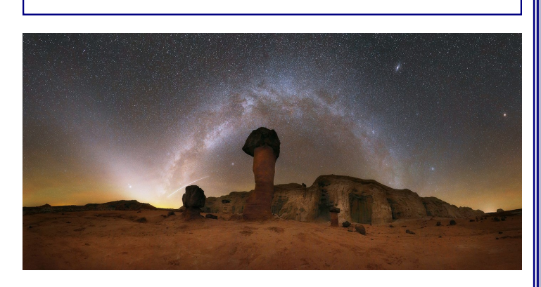
The Night Sky Party By: Neil Shet