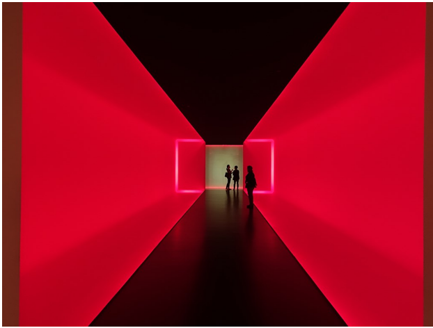
Red Bow Tie