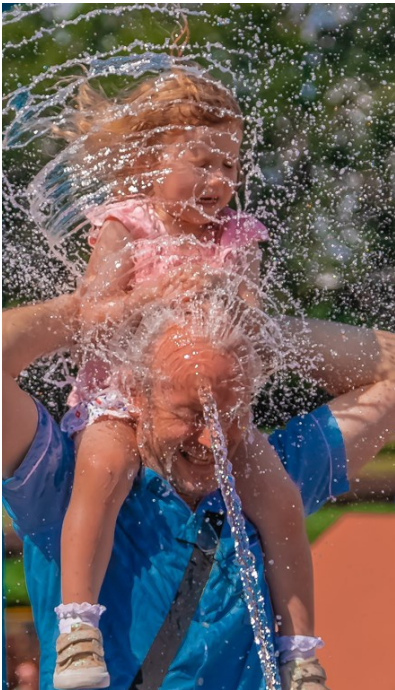
The Big Splash By: Prakash Shet

Each maker may submit one print. Pictorial print rules apply. Images will be judged outside the club.