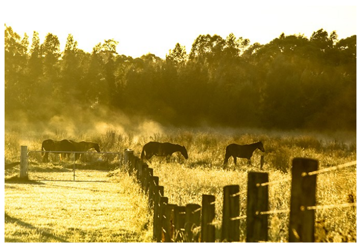
Huntington Field Early Morning