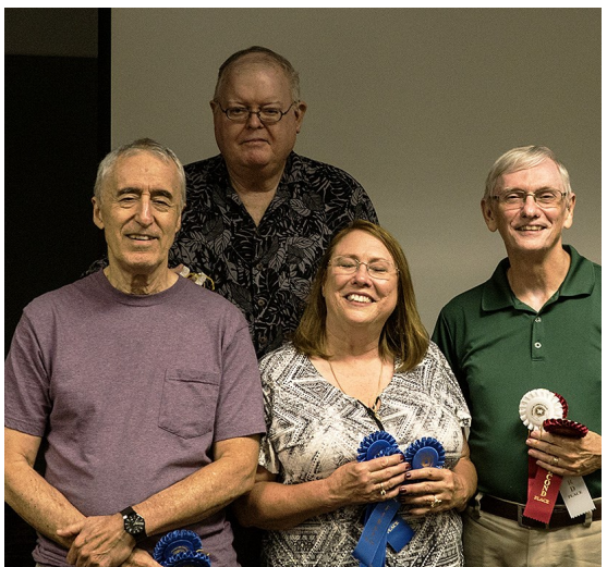
2017—2018 Year-end Winners

The Rangefinder is a publication of the Houston Camera Club, Houston, Texas.