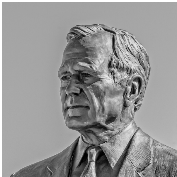
Geo. H. W. Bush 7748

The 2016 Wildlife Photographer of the Year exhibit is now open at HMNS. There is no additional charge for this exhibit beyond a paid admission to the museum.