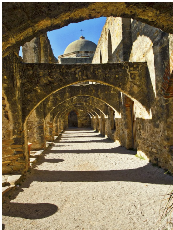
Arches, Mission San Jose