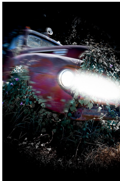
Thunder Road By: Terry Rutledge