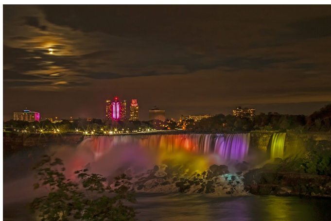
Niagara Fall at Night