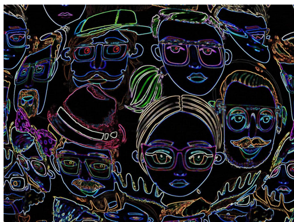
Faces and Glasses By: Glenn Sternes