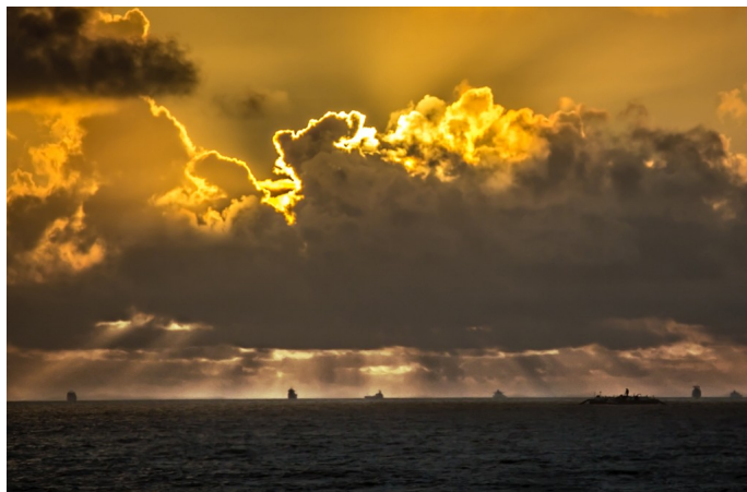
Early Clouds Over the Gulf