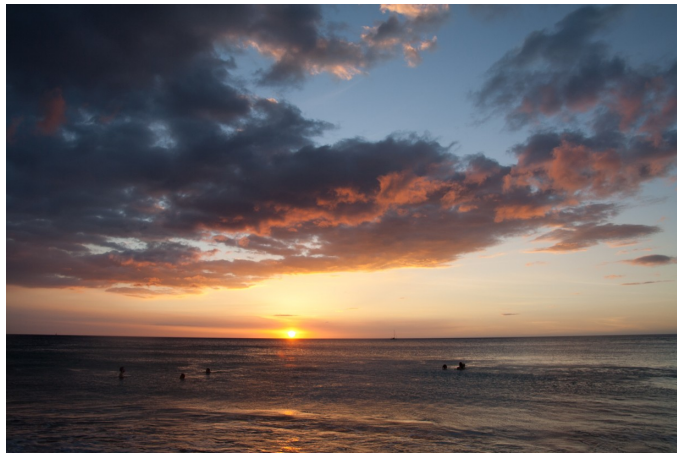
Clouds Over Water