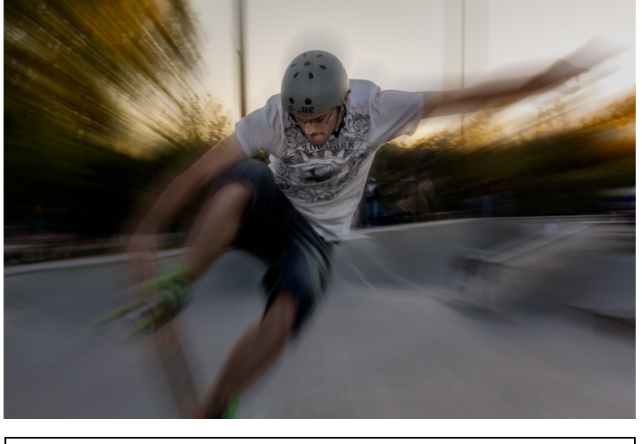
Maker: Ellen Pabst