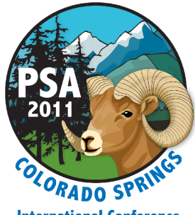
International Conference September 18-24, 2011

Make your plans to attend the 2011 PSA Convention. It will be held September 18-24 in Colorado Springs. To learn more about the activities and classes that are planned and the schedule or to register, visit www.psa-photo.org, the PSA web site.