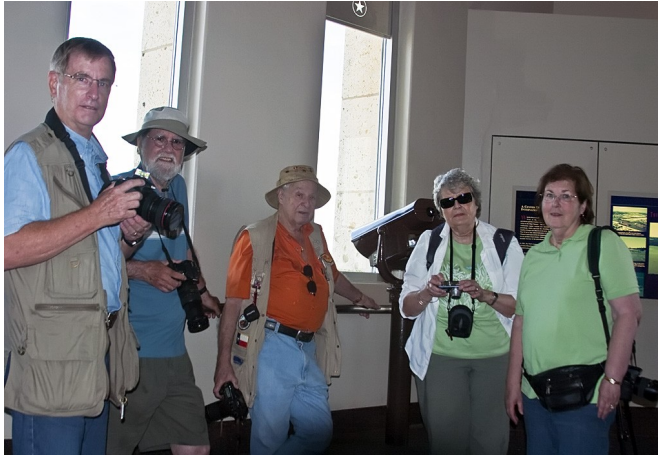
Top of San Jacinto Monument