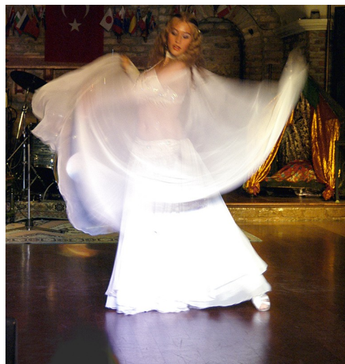
Lady In White