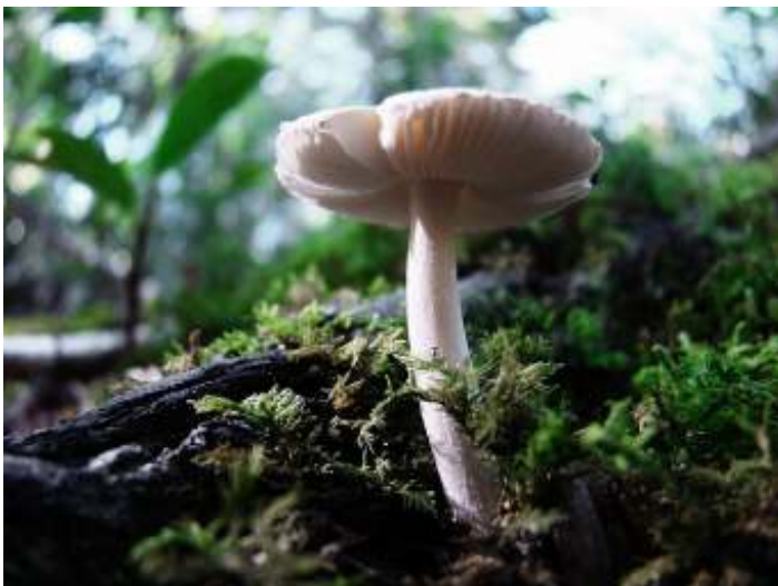
Mushroom No. 2