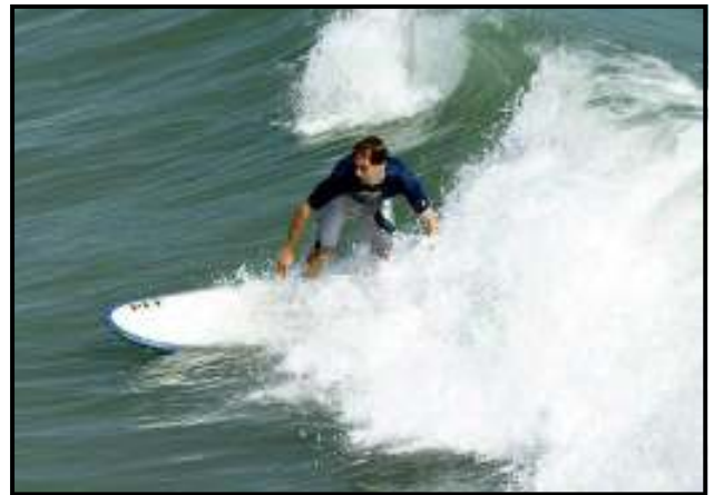
Trying to Hang Ten