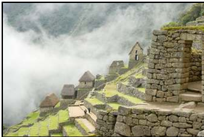
Machu Picchu