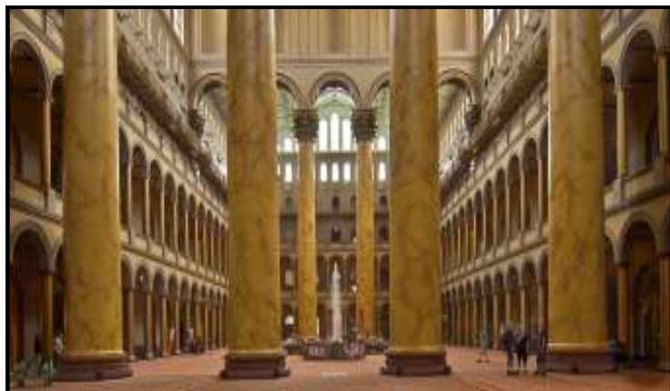
The Building..Museum First place winner in Earl Gilbert Architectural Contest