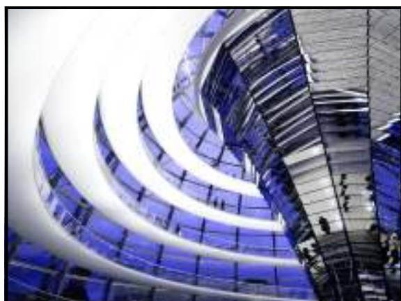
Reichstag Dome by Ken Groue 3rd place Architectural Contest