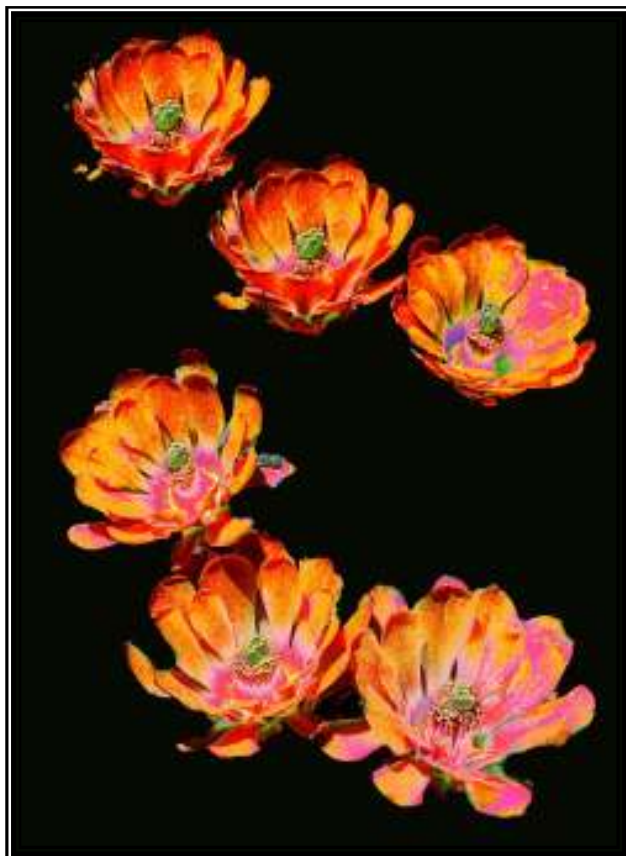
Color on Black (Creative Assignment)