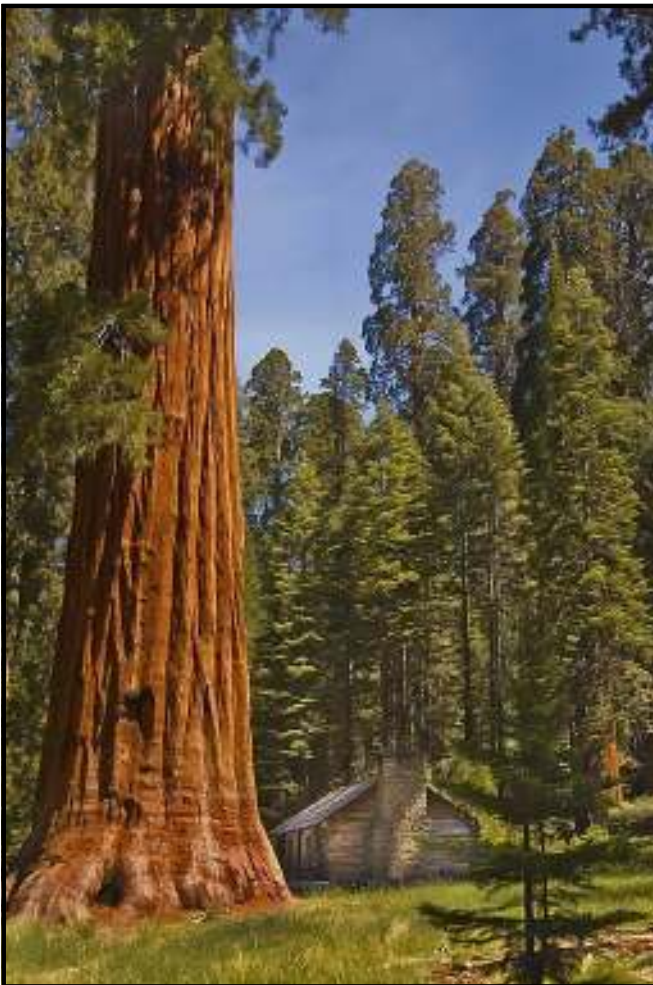
Big Tree, Little House

The date is Saturday, April 18 and the place is LaGrange, TX. The day falls two weeks after the GSCCC Convention in New Orleans. Reserve April 18 on your calendar.