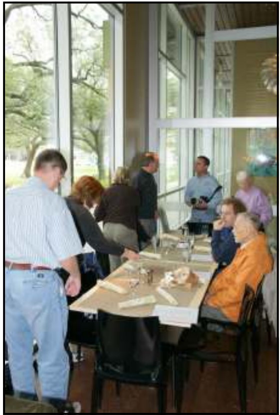
Getting seated for lunch on Discovery Green field trip