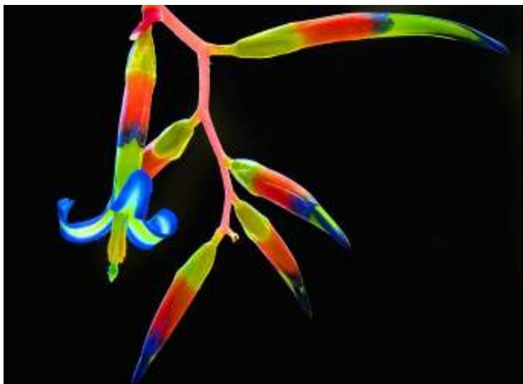
Bloom Bromeliad 2008