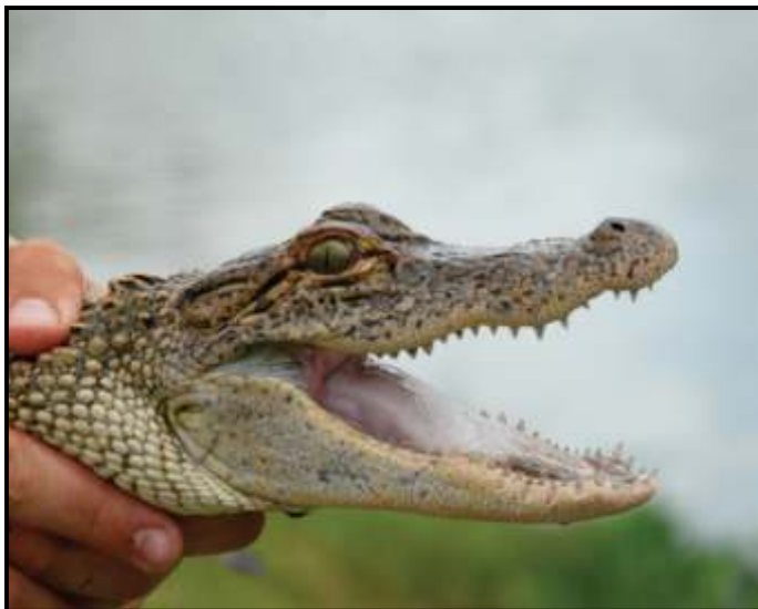
Little Al by Glenn Sternes