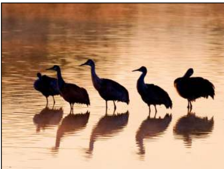
Dawn's Early Light